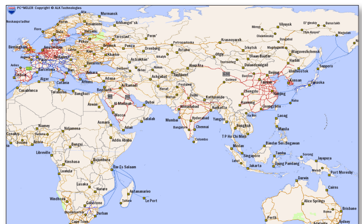
PC*MILER Map Coverage in Europe, Africa, Asia, and Oceania*