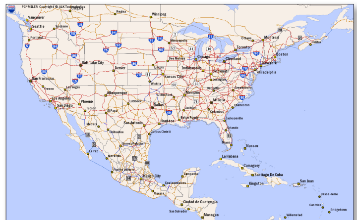
PC*MILER Map Coverage in North & Central America* (Coverage in Canada and South America not shown*)